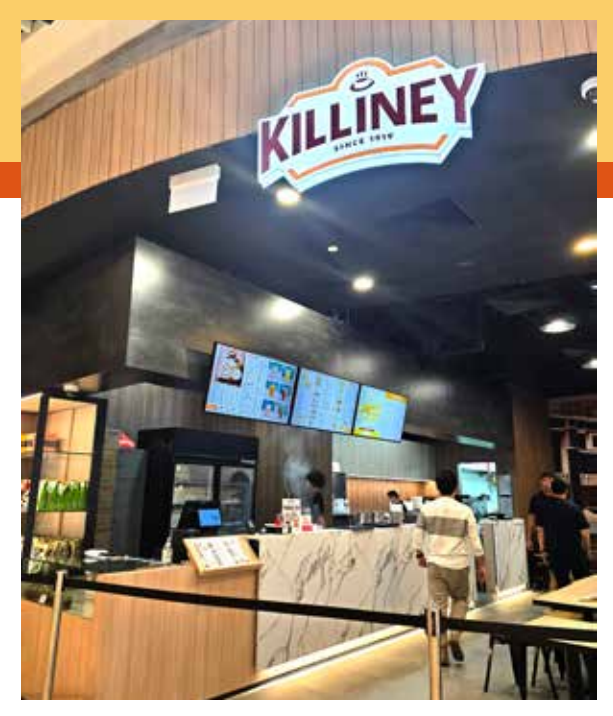
KILLINEY - Suntec City Mall 3 Temasek Boulevard #01-504, Suntec City Mall, Singapore 038983