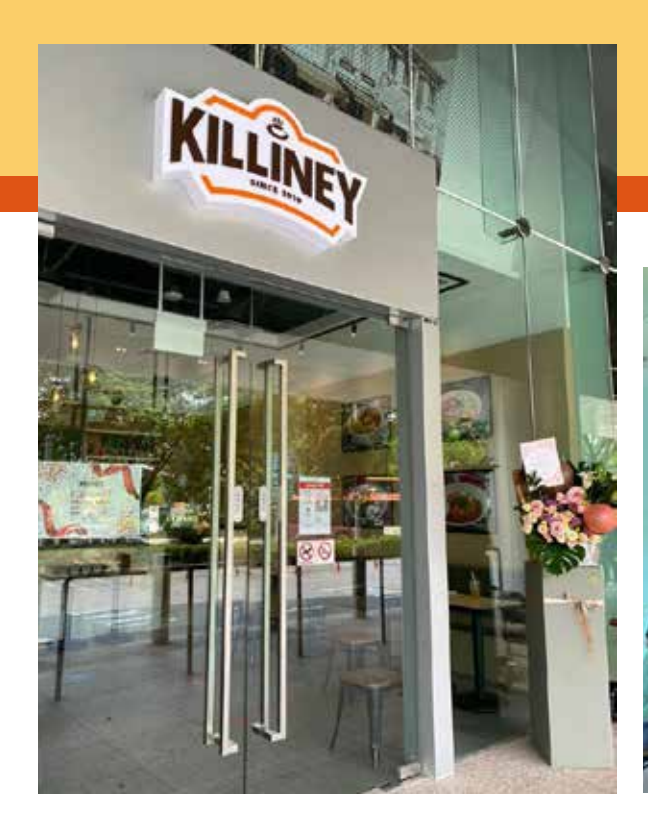
KILLINEY - 9 PENANG ROAD 9 Penang Road #01-13, Singapore 238459