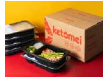
Extremely Low-Carbs 100% Keto compliant

Partnering with Ketomei to serve Keto-diet meals in Hapi Cafe. Members are also able to sign up for Ketomei subscription meal plan